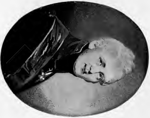
Alexander I. of Russia